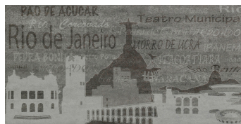
RIO DE JANEIRO AVA. ALL COLORS