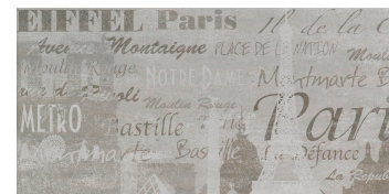
PARIS AVA. ALL COLORS