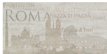
ROMA AVA. ALL COLORS