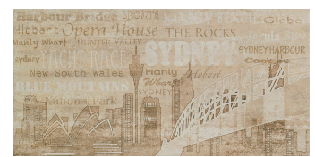
SYDNEY AVA. ALL COLORS