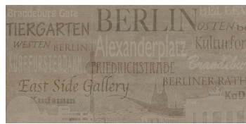
BERLIN AVA. ALL COLORS