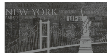
NEW YORK AVA. ALL COLORS